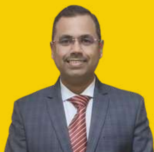
FCA Kush Shriram Tapas